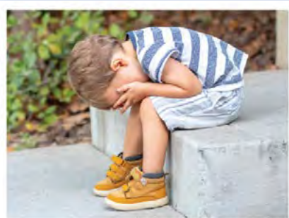
Figure 14.4 Being in control is important for young children. When they are not in control, they may become frustrated. As a teacher, what actions can you take to help reduce frustration in children?

Workplace Connections explore policies and guidelines in early learning environments.