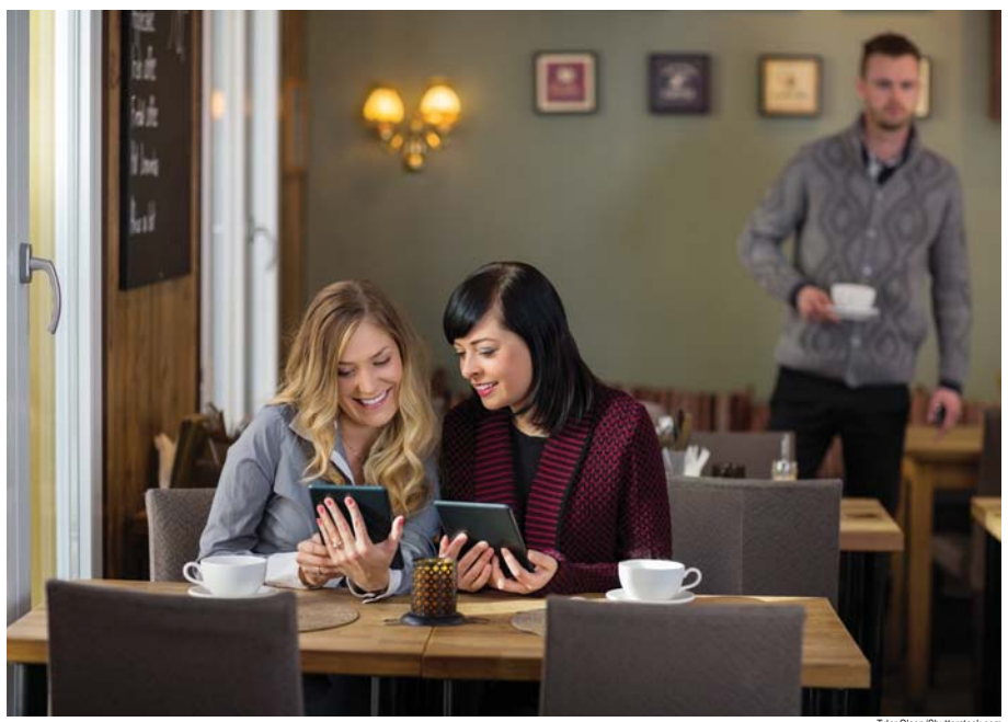
Figure 1-11 The practice of interior design offers the designer an opportunity to meet critical client needs in a unique, creative way.

as people skills. It involves business acumen as well as a graphic ability to communicate design by computer or hand sketching. The interior environment is composed of procedures, processes, and products. However, the critical element is the person who inhabits the space. This variety keeps design professionals engaged in the profession for many decades.