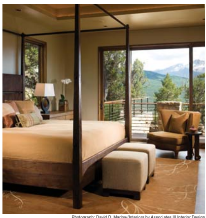
Figure 1-5 Helping people connect with nature within their interior environments is just one way designers help meet client needs. How does this environment help its occupants connect with nature?

The design of interior spaces should adapt to people as individuals, rather than people adapting to the designs of spaces. Bad design exists. Good design matters.