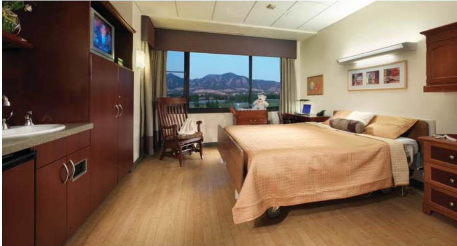
Boulder Community Hospital/LaCasse Photography

The influence of interior design on your daily life is very real and significant. Moreover, you have the power to control the design of the interiors you occupy by the choices you make, by what you specify, or what you buy. As a future interior designer, you will deal with these realities as you work with clients and their spaces.