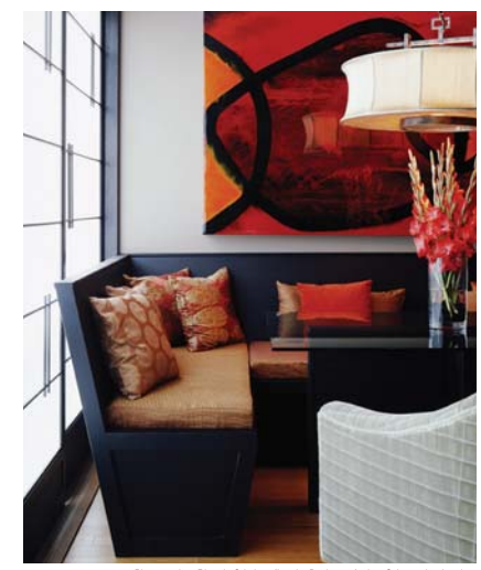
Interior Designer: Andrea Schumacher Inte Figure 1-8 Affirming cultural and social value is one way the interior designer helps clients. What features in this image affirm cultural and social value?

Interior spaces are vessels, or containers, for materials and artifacts that communicate items of cultural value in an unspoken language within physical environments. What does this mean? In essence, it means that the objects and belongings you surround yourself with reflect who you are and who you want to become. They reflect the culture and society in which you live, learn, play, and dream. The rooms you design never cease to send messages. Perhaps Shashi Caan, previous IFI president said it best, "Our interiors are the repositories of our memories and the containers of our dreams, aspirations, wants, and needs. They are the reflections of us, our society, our culture, and our time." See Figure 1-8.