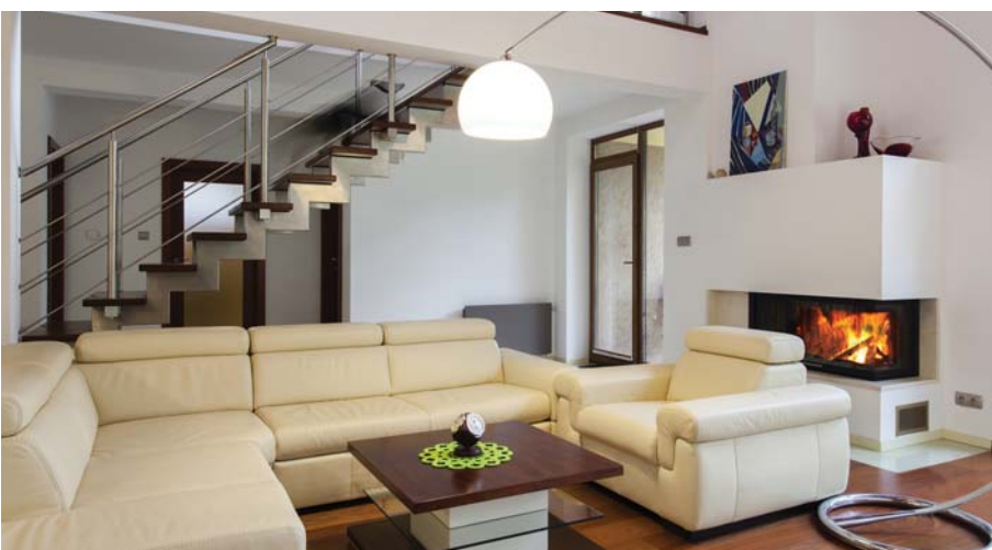
Figure 1-10 The design of a space that fosters kinship and familiarity helps provide comfort and reassurance to clients. What social values does the design of this space affirm?

The practice of interior design is a unique, ever-changing, fun, and innovative discipline. It is a business, an art, a study of people, a unique way of thinking, Figure 1-11. It involves intense problem-solving skills as well