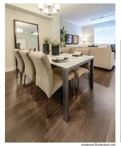
Figure 1-9 Culture can impact dining space and furnishings.

Design is human centered. Designers must think of people in a holistic way. As a profession, interior design has a history of addressing issues relating to social responsibility such as sustainable design and design that meets the needs of all people, including those who have special needs. Interior designers are also designing for a growing population of people who view the world differently, including those who may have autism, traumatic brain injuries, and Alzheimer's disease. For example, the ideal workspace for those who have some level of autism or traumatic brain injury